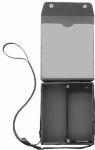
Hard case HC20 for multimeters with protective cover and accessories

for multimeters (without protective rubber cover) and accessories